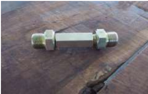
Fig: Non return valve