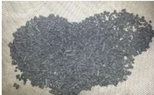
Fig: Activated Carbon Pallet