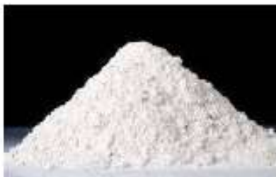
Fig: Lime Stone Powder