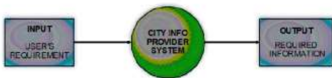
Figure. 1 Data Flow Diagram